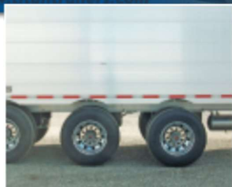
All Aluminum Chassis