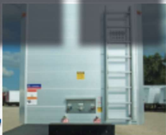
Front Ladder Drivers Side