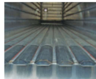
Keith® Walking Floor® Aluminum flat Top V Slat with Steel Tips