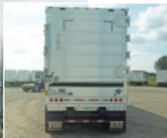
Compactor Side Swing Door