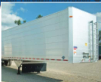
Mudflaps at Landing Gear